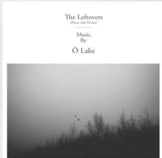
The Leftovers Single (2017)