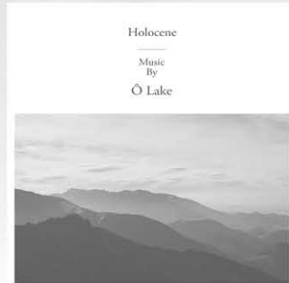
Holocene Single (2018)