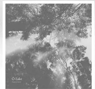
Souvenirs Single (2020)