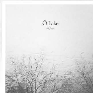
Refuge Album (2019)