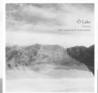
Gerry Album (2021)