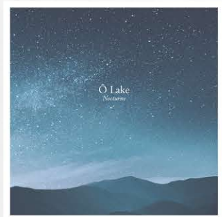
Nocturne Single (2021)